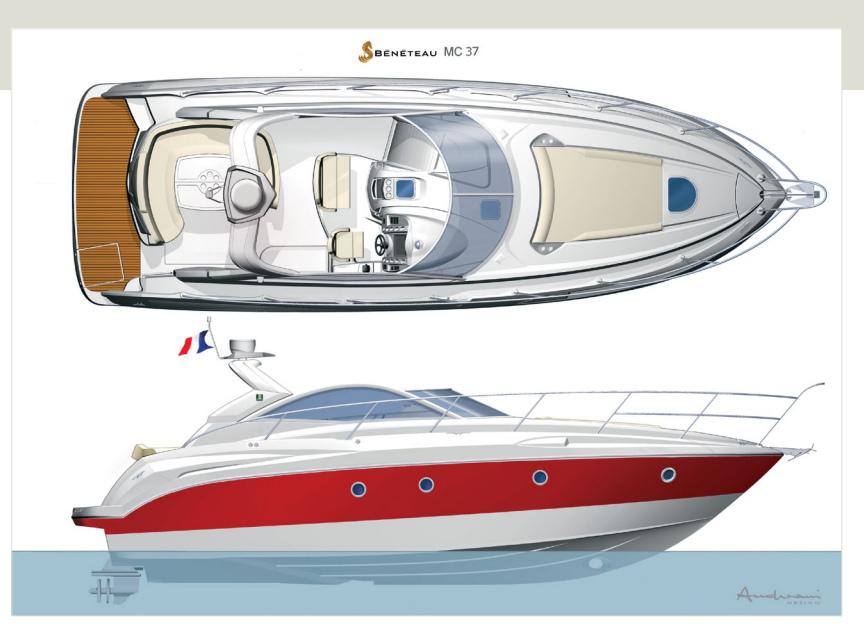
Andreani Design offers a complete product design and development services, including engineering and industrialization.