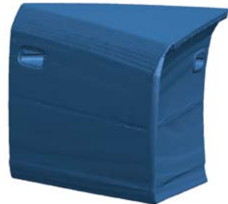
Resulting envelope shape.

• Extraction path integrated into assembly/ disassembly steps of other components within the assembly – as part of the sequencing application the extraction path can be embedded in the middle of the assembly or disassembly process.